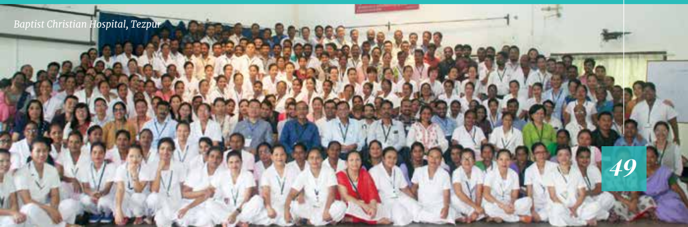
Baptist Christian Hospital, Tezpur

Baptist Christian Hospital (BCH) is located in Tezpur, a city and urban