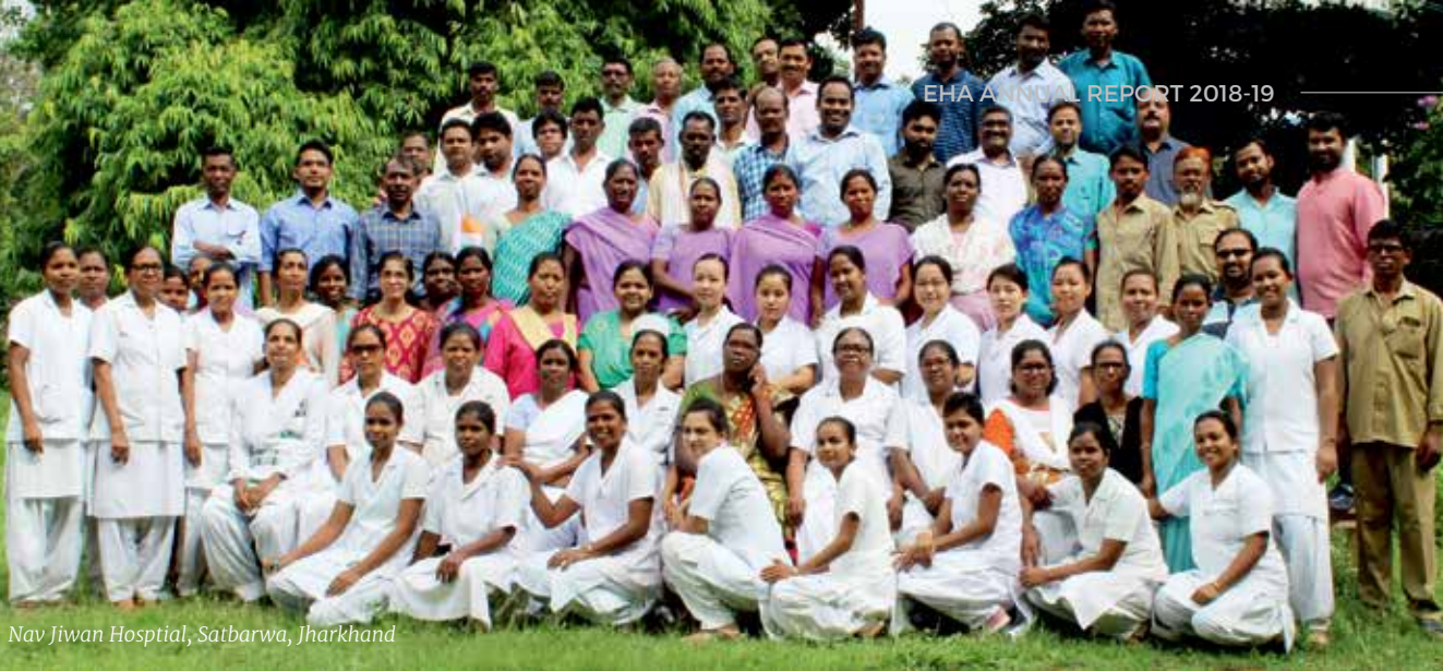
Nav Jivan Hospital, Satbarwa, Jharkhand