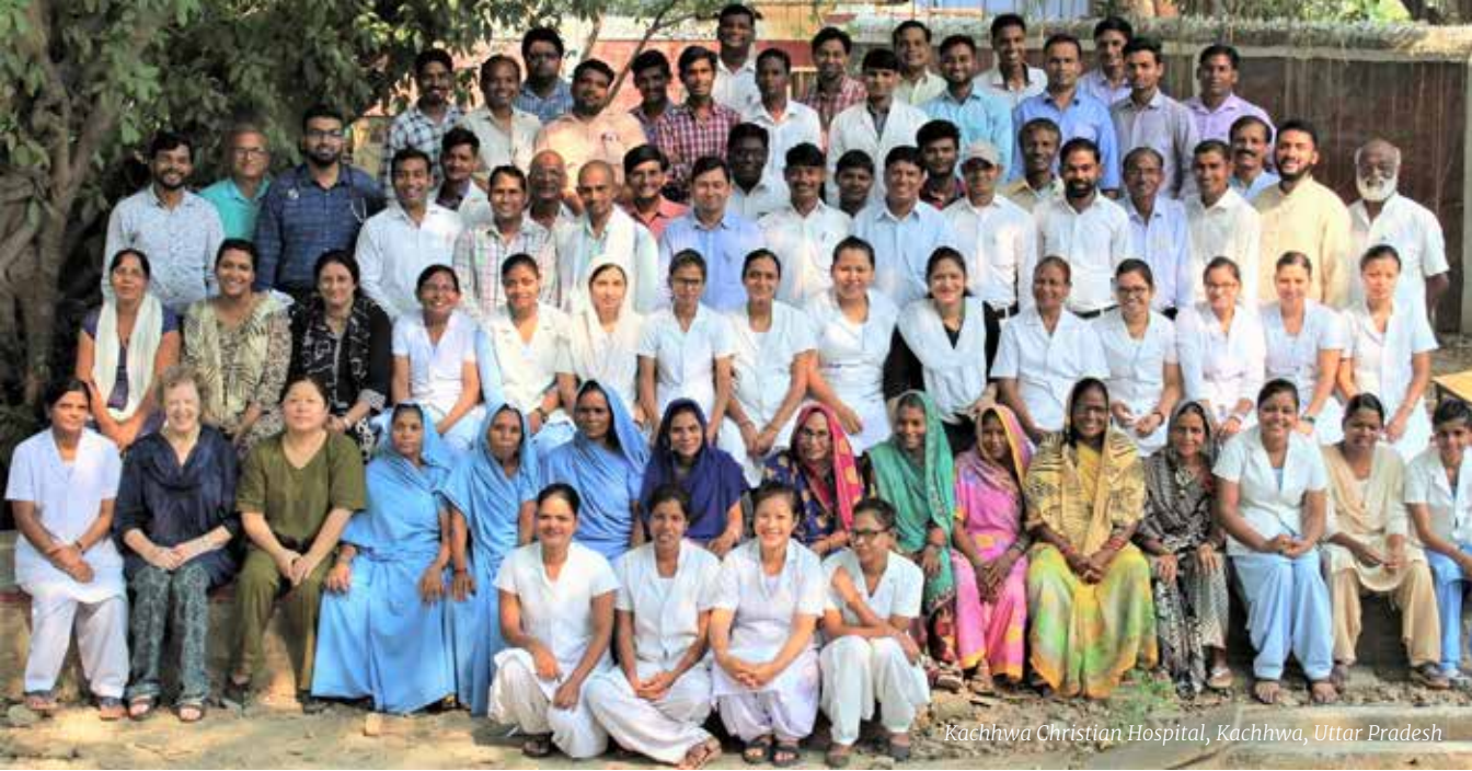
Kachhwa Christian Hospital, Kachhwa, Uttar Pradesh

Kachhwa Christian Hospital (KCH) is situated in a small town called Kachhwa Bazaar in the district of Mirzapur, Eastern Uttar Pradesh. The hospital is 122 years old and is the oldest of the EHA hospitals. Surrounded by villages where some of the poorest in the country live, the hospital was established in 1897. With a history as a busy surgical centre, the hospital was incorporated into Emmanuel Hospital Association in 1974 . In keeping with the definition of health by WHO which states “Health is a state of complete physical, mental and social wellbeing and not merely the absence of disease or infirmity”, the focus of the hospital became more than just treating patients. A host of health projects were introduced to help the villages around to reduce the disease burden of the community and help them with income generation.