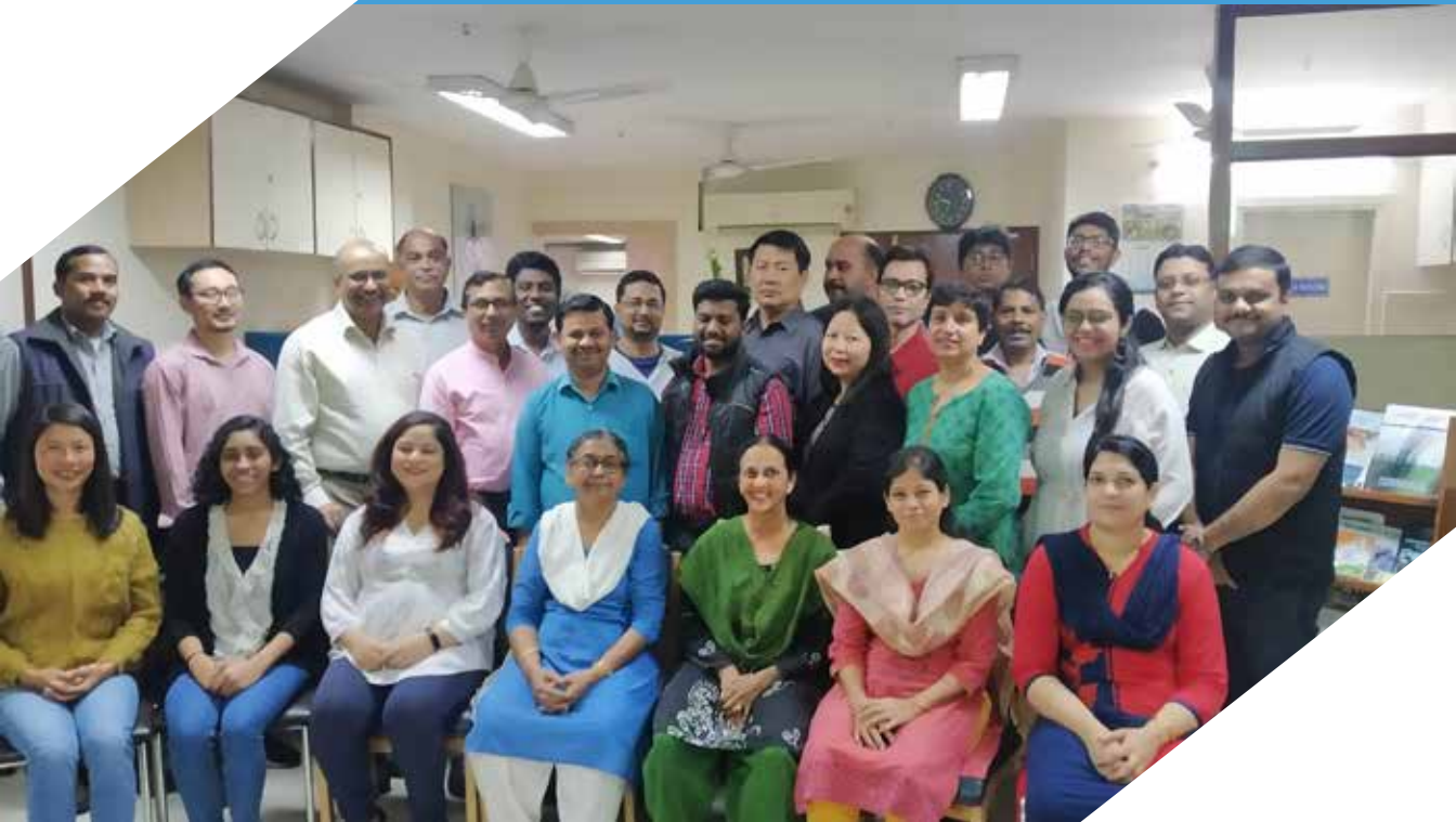
EHA CENTRAL OFFICE