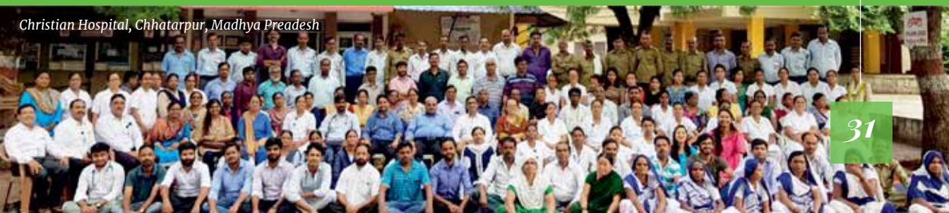
Christian Hospital, Chhatarpur, Madhya Preadesh

Services provided are obstetrics & gynaecology, paediatrics, medicine, orthopaedics and ophthalmology. There was an increase of 2% in inpatients and 5% in deliveries. However, there was a 3% decrease in outpatients. Ultrasonography (USG) was restarted with the required registrations. The paediatrics department saw a rise in neonates , with a good number of babies born outside the hospital being managed in the NICU. In the absence of a full-time ophthalmologist, 322 IOL cataract surgeries were possible at the eye camps, with the optometrists evaluating and managing common complaints. Orthopaedics and Echo screening (for diagnosis of hearing loss in neonates) were the services added during this year.