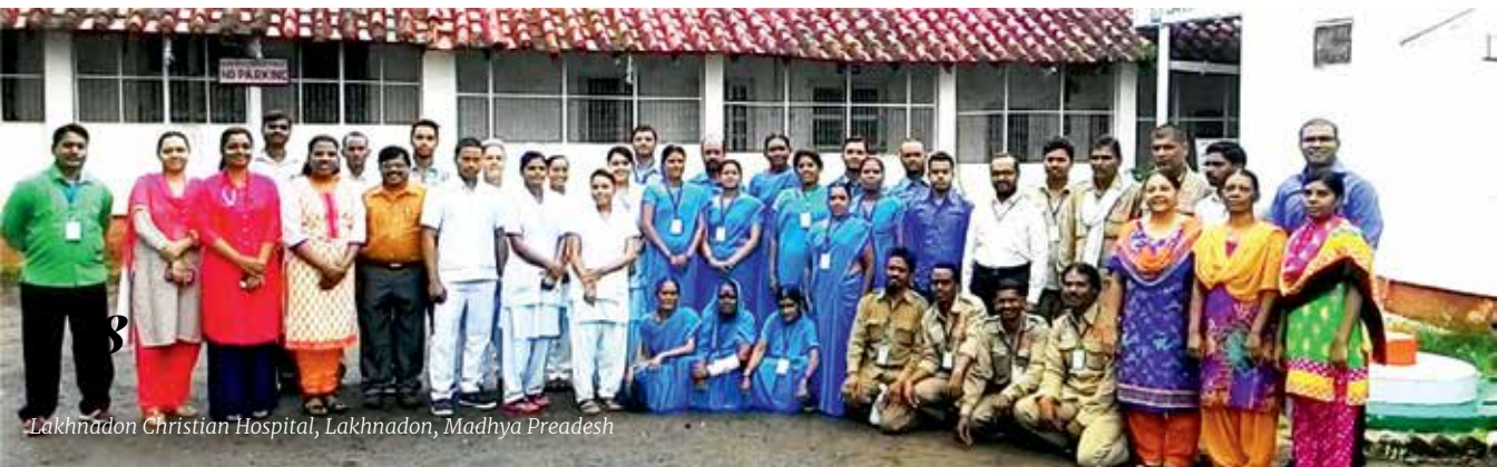
Lakhnadon Christian Hospital, Lakhnadon, Madhya Preadesh

1936, saw the first buildings of this hospital, which were a 5-bedded inpatient unit, to later become the