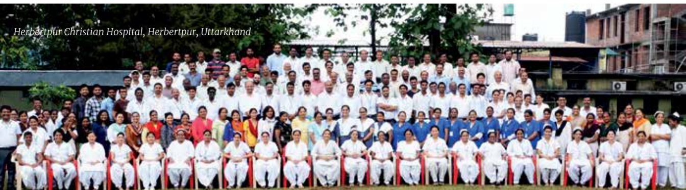
Herbertpur Christian Hospital, Herbertpur, Uttarkhand

A year of weekly Non-Communicable Diseases outreach focused on 10 villages in the Bansi area has been completed. House-to-house surveys were done and people encouraged to participate in the Wednesday afternoon clinic. Real changes were visible as people received whole-person care.