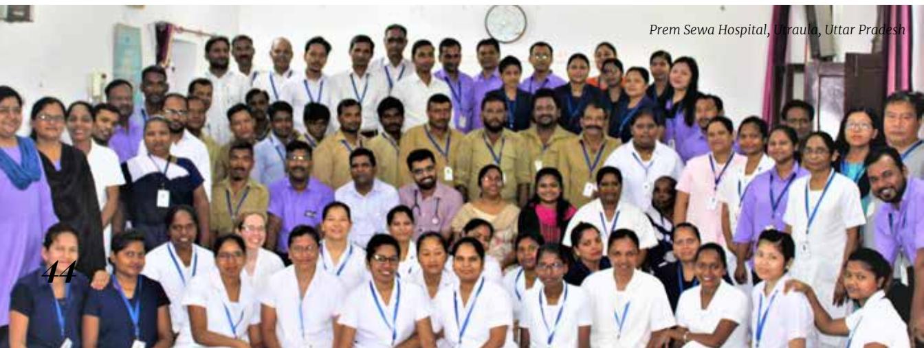
Prem Sewa Hospital, Utraula, Uttar Pradesh

The major services are mother and child-care (MCH), infertility treatment, eye, dental and palliative care. Three baby warmers gifted by friends helped the neonates survive during winter. Ophthalmic services are also well developed, contributing significantly to addressing the huge