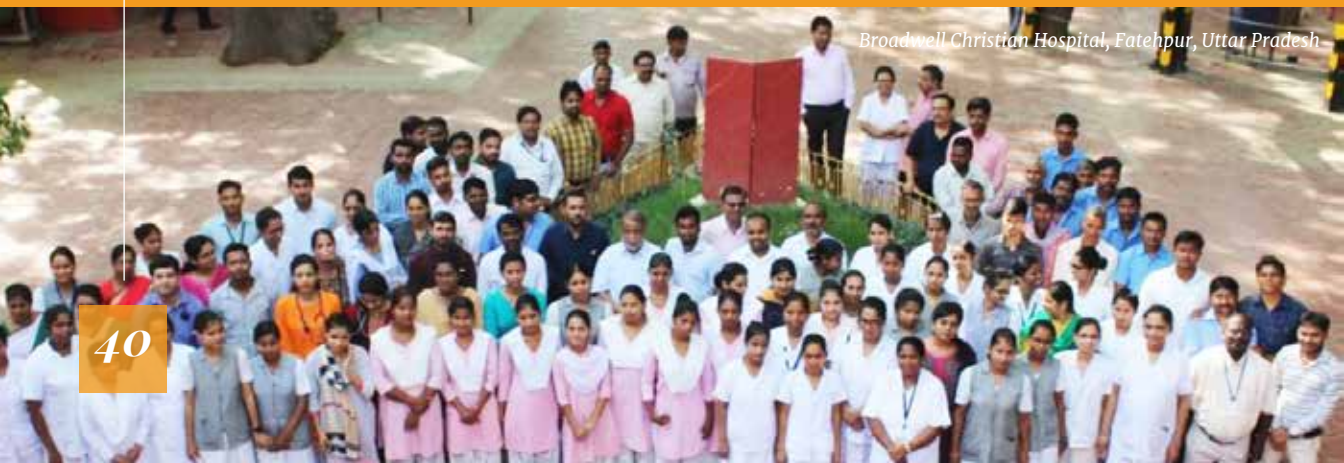
Broadwell Christian Hospital, Fatehpur, Uttar Pradesh

Services - The hospital offers services in obstetrics and gynecology, general surgery, orthopedics, physiotherapy, general medicine, paediatrics,