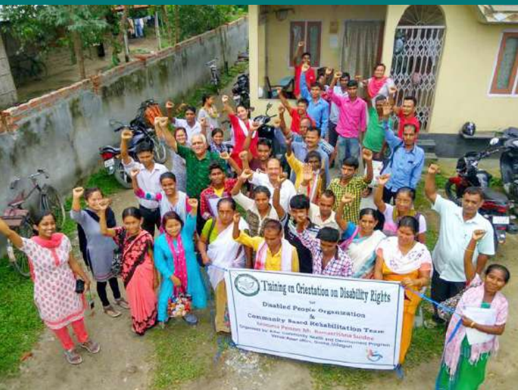
Training on orientation on disability rights