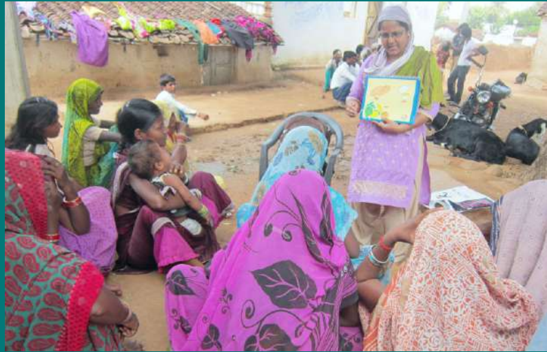
Formation of Mothers Group - Discussion on Female Reproductive Rights