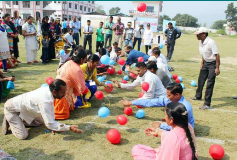
Disabled people meet