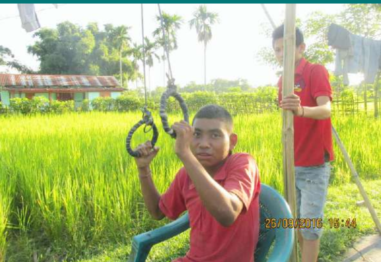
Home based therapy devices